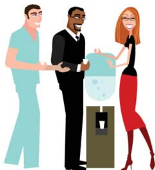
Employee Open Forum Dec. 7, 2011

Answer: Wireless devices (cellular phones and Personal Digital Assistants or PDAs) may be used by physicians, staff, patients and visitors except within one metre of a ventilator. Pagers may be used throughout the hospital and two-way radios may be used by West Park security and emergency services personnel except within three metres of any medical device. To read the full policy, go to the policies and procedures section on the intranet.